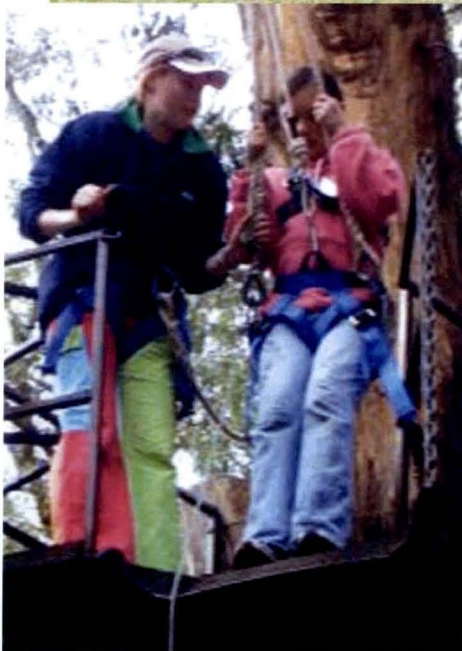
above: Learning new skills at Camp Britannia, held at Britannia Park