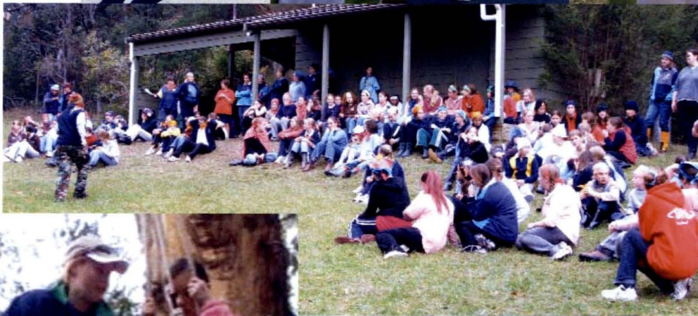
left: Participants in the annual State event, The Stradbroke Cup