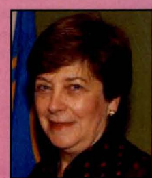
Senator The Hon Kay Patterson