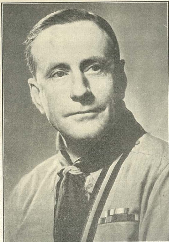
LORD ROWALLAN, Chief Scout.

The influence of that great International Scout gathering had a marked effect on the Movement for it enabled many leaders who attended not only to see something of the greatness of Scouting but also to attend Gilwell Training Courses held at Gilwell Park, Chingford, England, the home of Scout training.