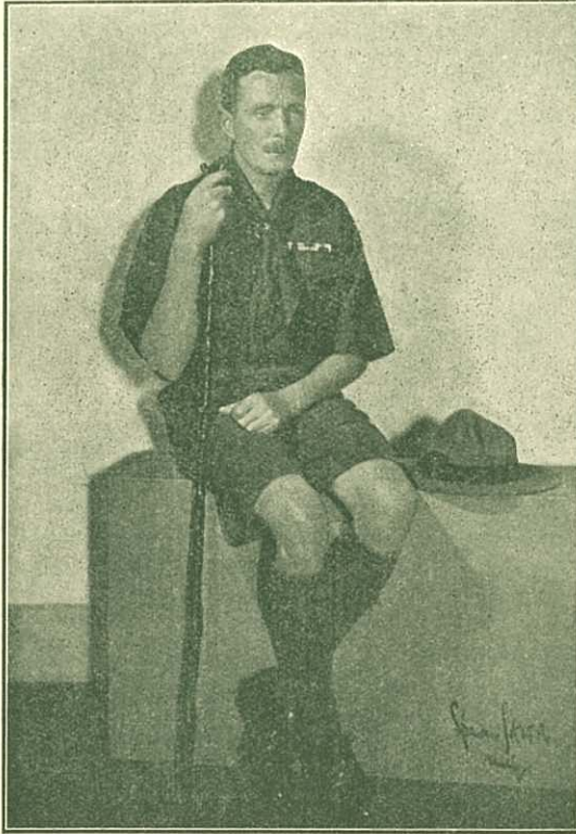
HIS EXCELLENCY, LORD SOMERS, CHIEF SCOUT FOR VICTORIA

Thus the term "Scouting" implies the practice, and the finest attributes of backwoodsmen, explorers and frontiersmen. Mainly through outdoor activities and handicrafts, it gives a boy a practical and liberal education, stressing all the time the necessity for him to apply his efficiency in service to the community.