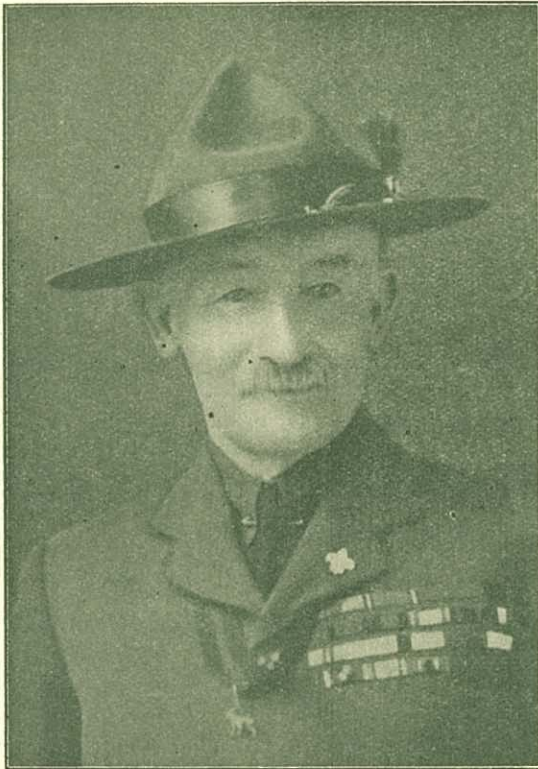
WORLD CHIEF SCOUT

B OY SCOUTING, as we know it to-day, had its beginnings in the actual experiences of Robert Baden Powell, schoolboy of Charterhouse, some 60 years ago. He wrote in the "Boys Own Paper" in 1926, that he began Scouting "half out of bounds at school. Our playing fields were on the plateau top of a hill, whose steep sides were clothed with a regular jungle of brushwood and copse. And there I used to sniggle away and set snares for rabbits. If and when I caught one—which was not always—I skinned him and cooked him and ate him—and lived.