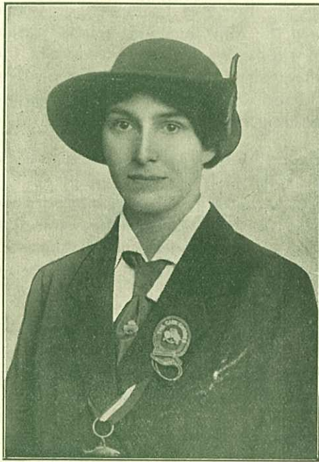
LADY BADEN POWELL, WORLD CHIEF GUIDE

WHEN Lord (then Sir Robert) Baden Powell formulated his scheme of Scouting for boys he did not expect it to be adopted by girls, but all over England girls began to play the game of Scouting, and individuals and patrols adopted the handbook, called themselves Girl Scouts, and some even managed to have themselves registered in the new movement. At the Crystal Palace Rally in 1909—just two years after Scouting was first introduced—800 girls turned up and refused to be ignored!